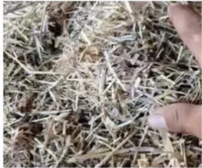
Dry wheat straw