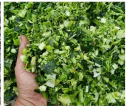
Wet corn stalk