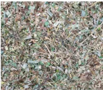
Dried corn stalk