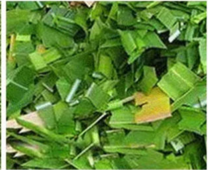
Sweet elephant grass