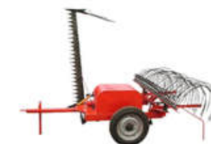
Cut & Rake